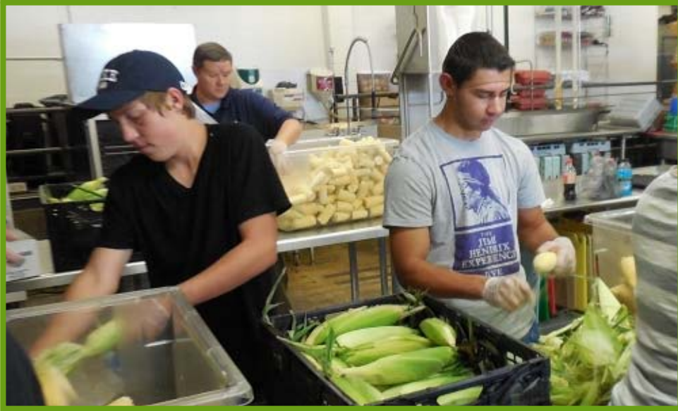
Greeley West baseball team shucking locally grown corn to be served in school lunches throughout District 6.